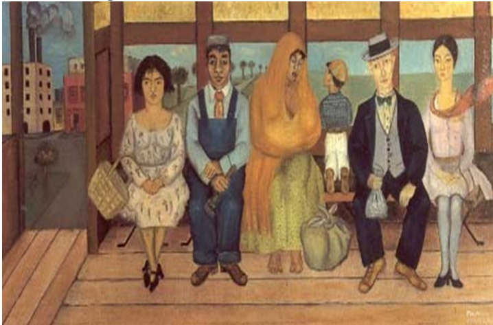
The Bus 1929