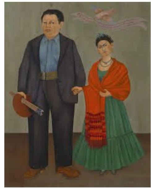
Frida and Diego Rivera 1931