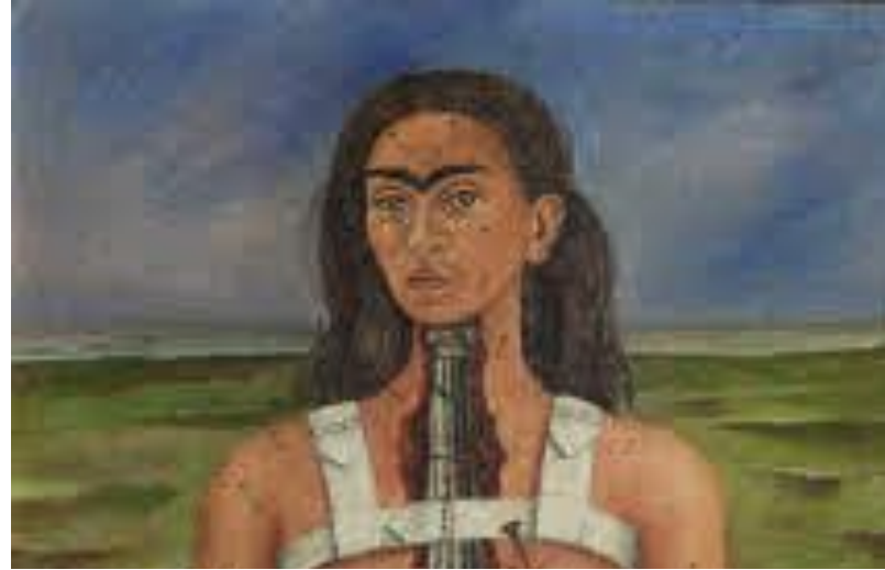
The Broken Column 1944

"I am not sick. I am broken. But I am happy to be alive as long as I can paint." ~Frida Kahlo