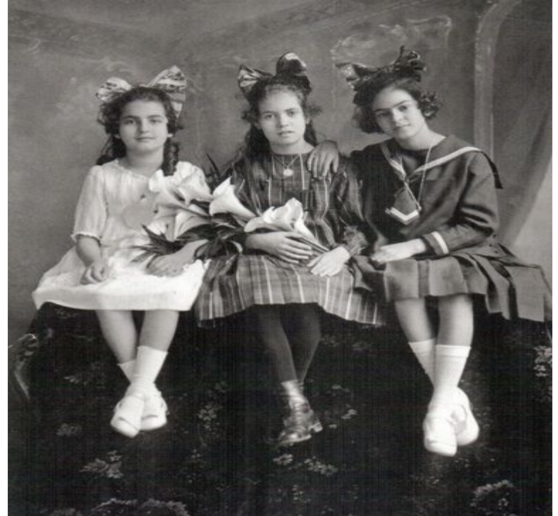
Kahlo and her sisters