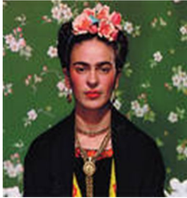
Frida Kahlo 1907 - 1954