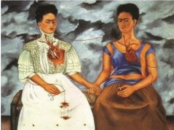
The Two Fridas, 1939

Despite her fame today, Kahlo sold few paintings in her lifetime. Her only solo exhibit took place the year before her death.